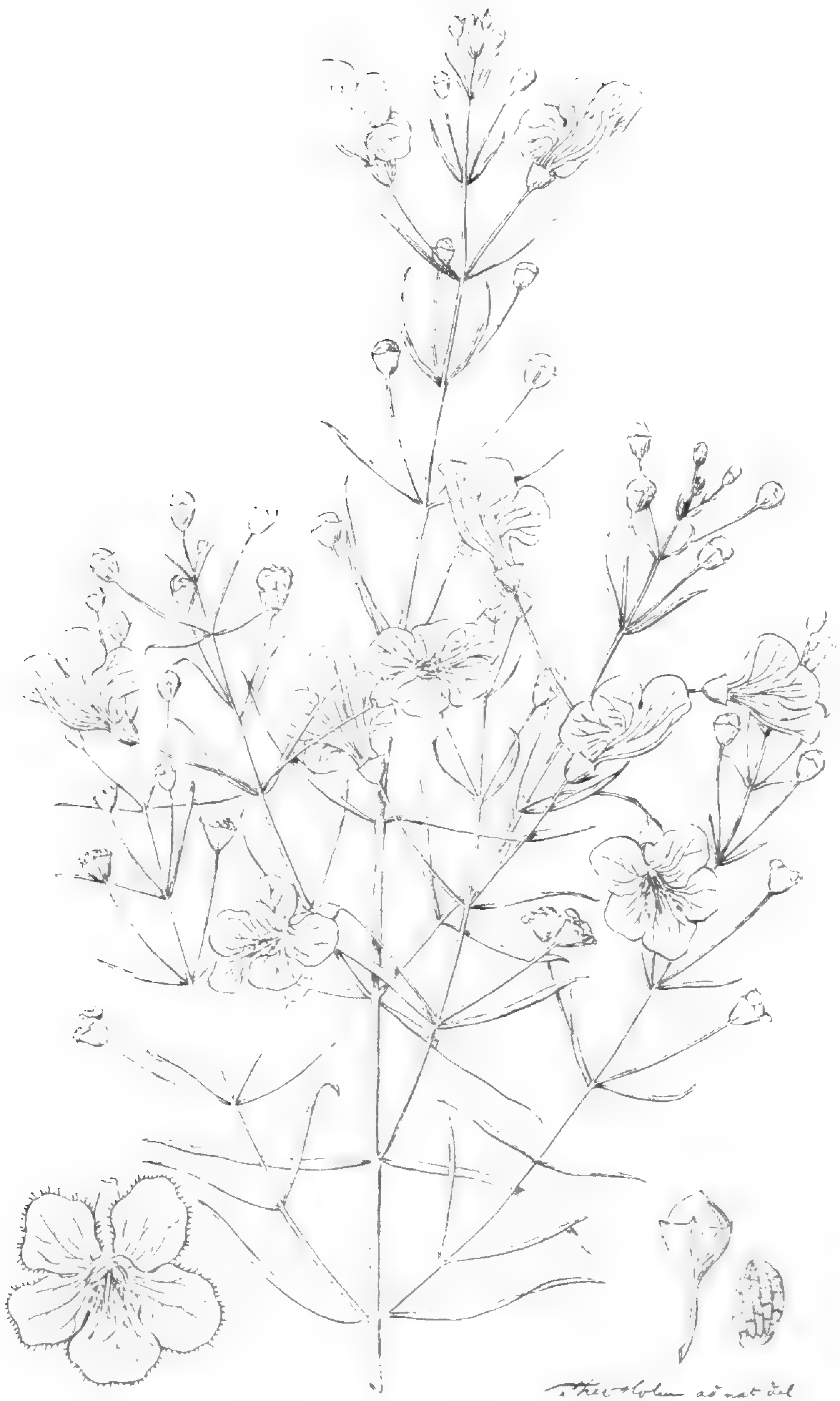
GERARDIA HOLMIANA, Greene.